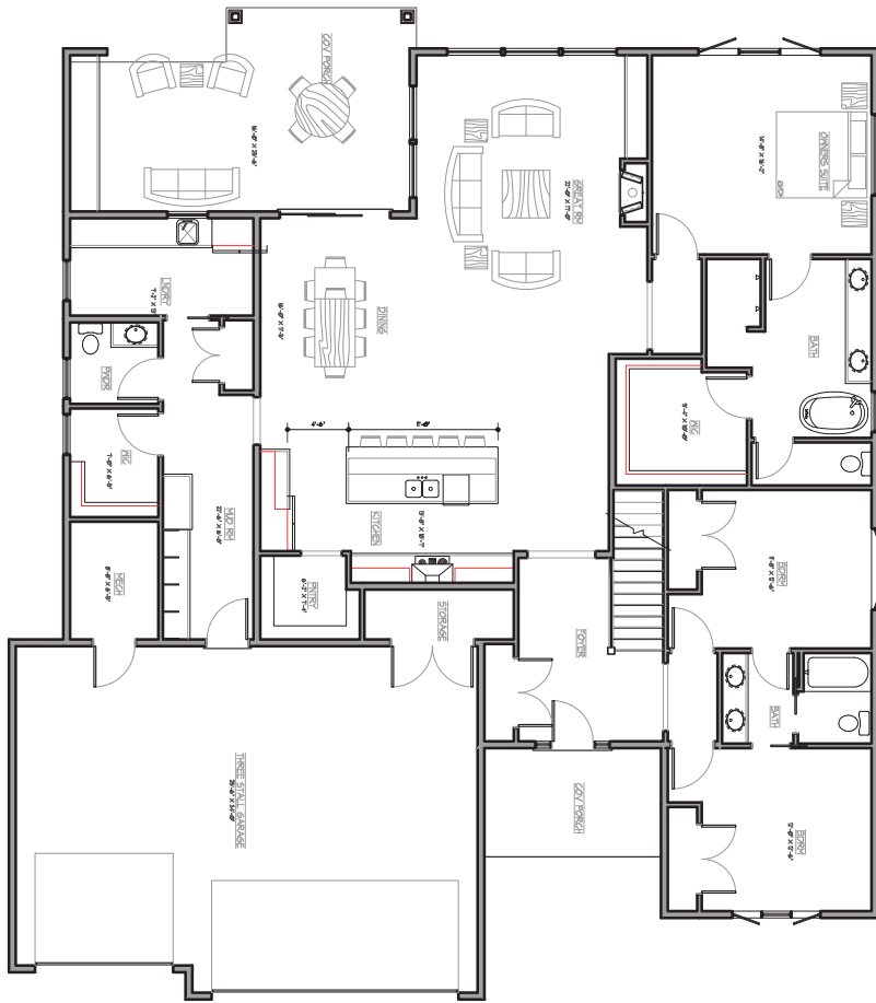
MAIN FLOOR: 2,632 SQ.FT.